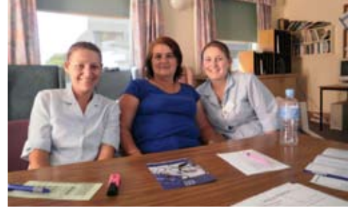
PCA members at Fred French

The main instigation for nurses and carers comments was due to their perception of inequity within the majority of facilities. At one site permission was given to staff to wear their own cotton tops in place of their non-natural-fibre uniforms if they wished on the very hot days, but no clothing allowance was offered.