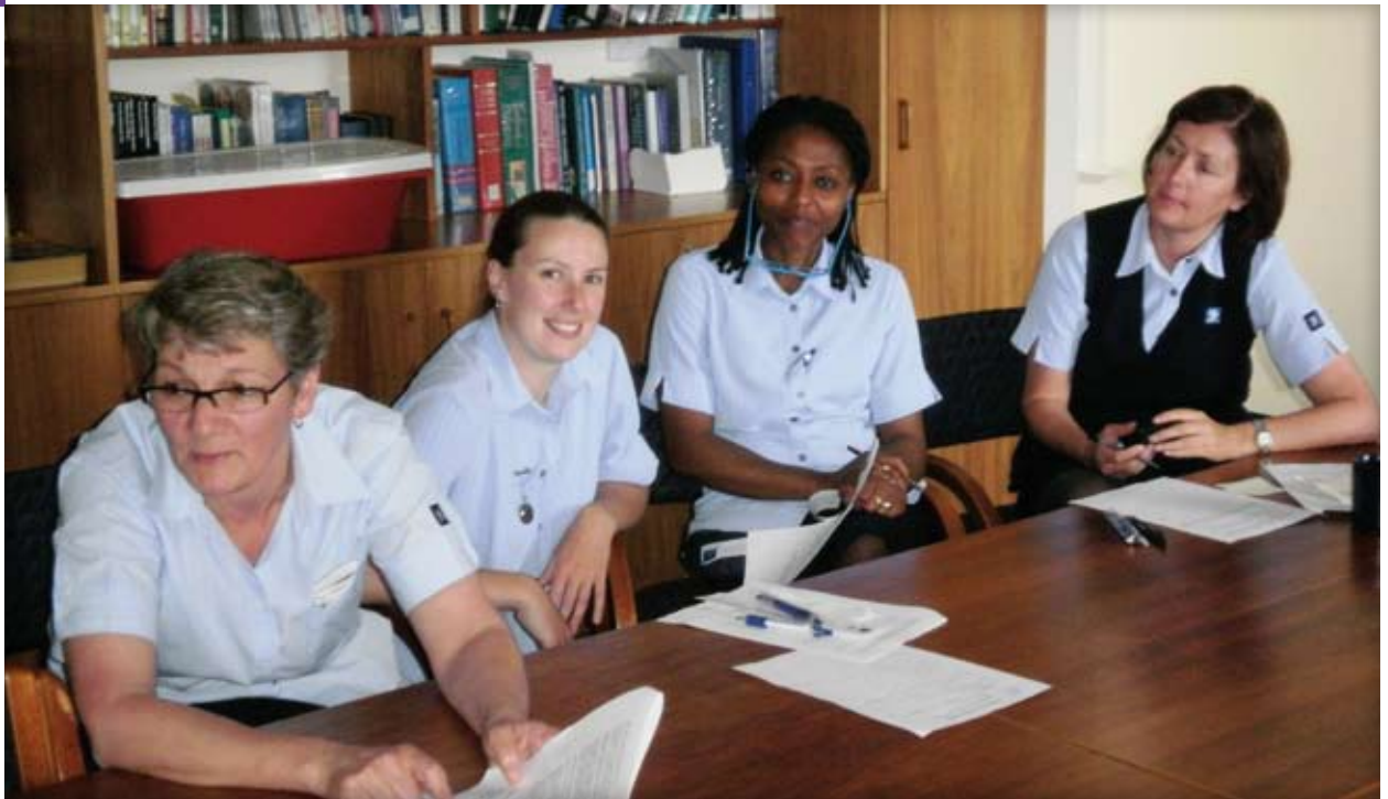
Calvary EBA Discussions