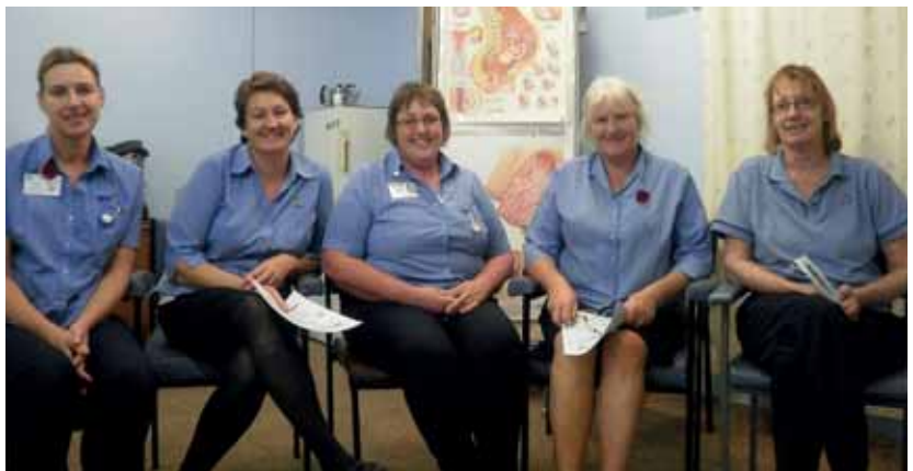
The team at Scottsdale NESM

At the time of writing, the online staff satisfaction survey was due for completion. ANF will report findings back to members and work with Management to try and implement any positive suggestions identified.